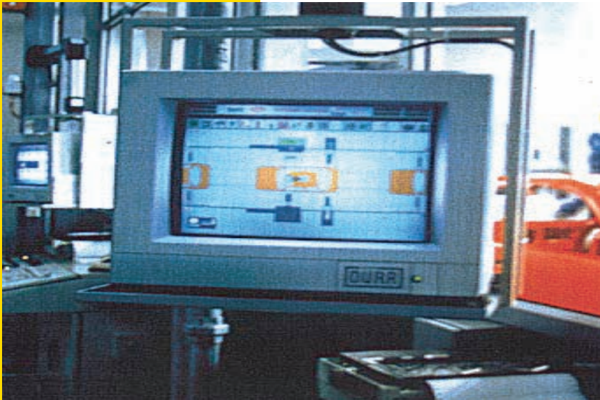
Operators manning the Dürr Ecopaint system have an exact on-screen replica of each vehicle's progress through the painting booth.

Dürr Painting needed a system that would work for multi-national customers such as General Motors, Volkswagen, Daimler Benz, BMW or Fiat.